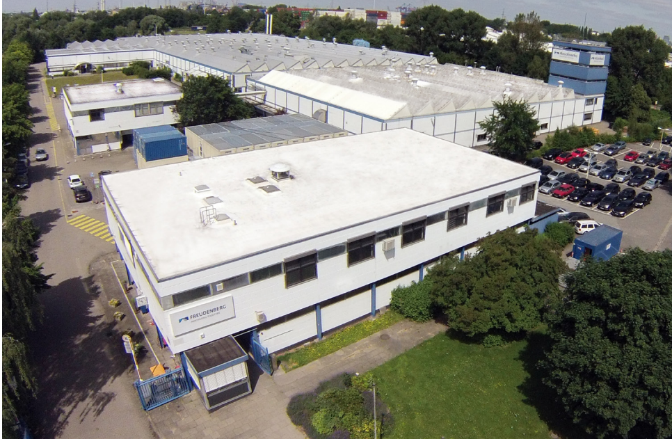
Image: FST Hamburg, aerial view.

product data have also played an important role when the PDM system HELIOS was chosen. “Once released, a part must be effectively locked against changes. Also important is that the data are always kept current and can be viewed in a central data pool, as many different departments and colleagues work with the same data. By providing global access via the HELIOS Internet Server, the PDM system HELIOS offers an ideal platform for all kinds of requirements“, says Björn Quelle.